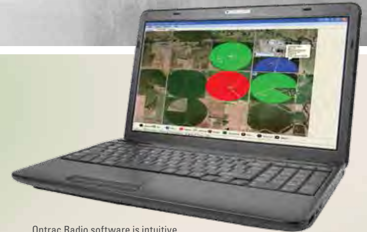
Ontrac Radio software is intuitive and easy to use.

As part of the process, Reinke engineers will also perform a communication path study. They'll factor in pivot locations, pivot path, area signal strength, terrain features and ground obstructions to make sure your Ontrac Radio system operates flawlessly.